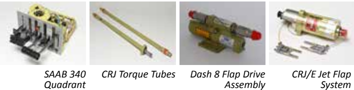
SAAB 340 Quadrant