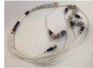
Sikorsky Fast Helicopter Gearbox Prototype