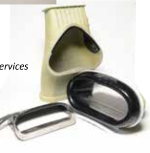
De-Ice Boot Services