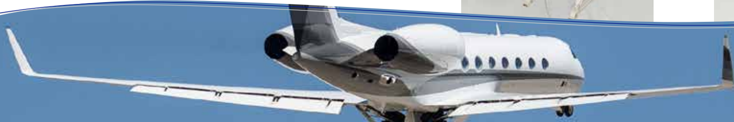
CRJ/E Jet Flap System