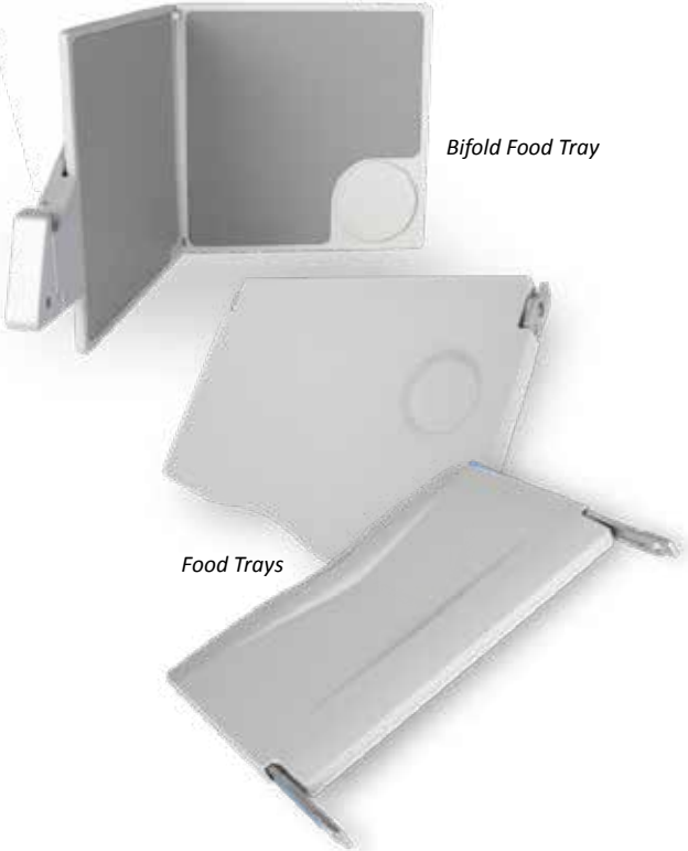
Bifold Food Tray