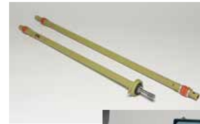
CRJ Torque Tubes